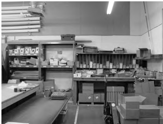
Literature Distribution Area - NCRSO